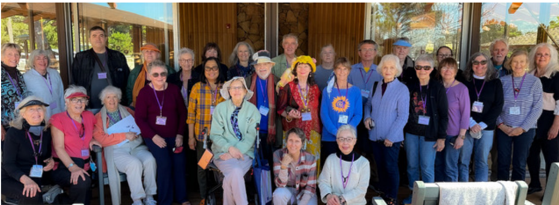
Yuki Teikei members at the retreat.