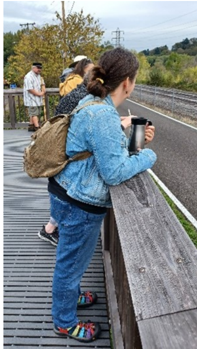
Haijin enjoying the ginko walk.