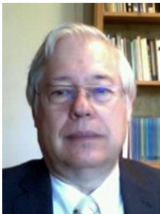
Richard Tice Washington