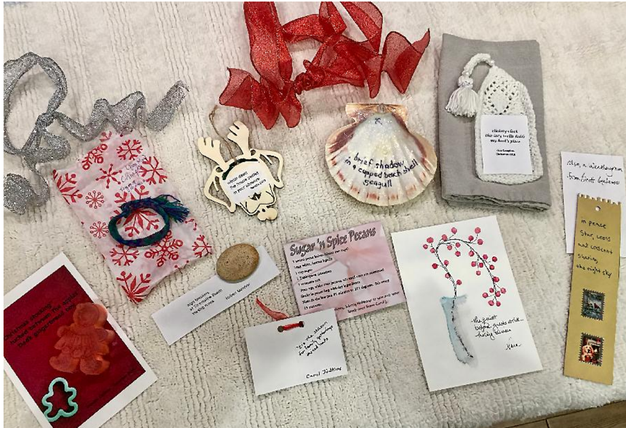
"Haiku Gifts" exchanged at event

another painted, one knitted, another gathered smooth stones . . . the array of gifts was amazing and the insights into each poet touched our hearts. (please see photos)