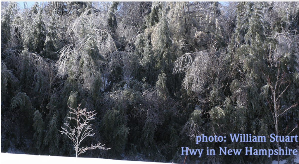
photo: William Stuart Hwy in New Hampshire