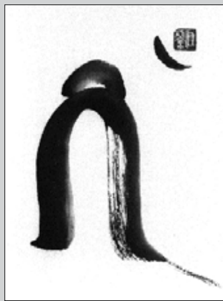
sumi-e by Lidia Rozmus

c/o Charles Trumbull 1102 Dempster Street Evanston, IL 60202-1211